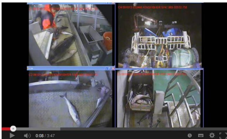
Demonstration of CCTV on fishing vessel

Support innovative ideas for selective gears